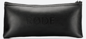
ZP1 padded zip pouch