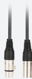
10m connector cable