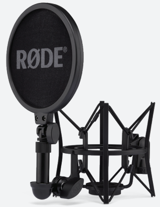
SM6 shock mount & pop filter